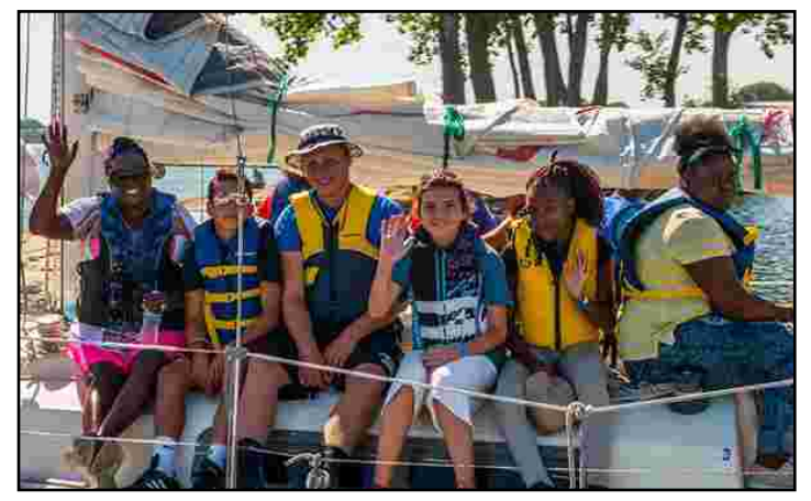
Part of the Nehemiah Group aboard Solitude.

Community Sailing - On July 28 and 30, the Sailing Club hosted nearly 200 children from the Nehemiah Partners summer camp. Nehemiah Partners is a non-denominational after school program serving kindergarten through 8th grade children. During the month of July a weekday summer camp is held to engage the children in nontraditional activities within the community. Golf, archery, horseback riding and sailing were offered in separate weeks during this year's camp.